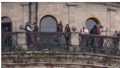
40x Clear Image Zoom (1152 mm)