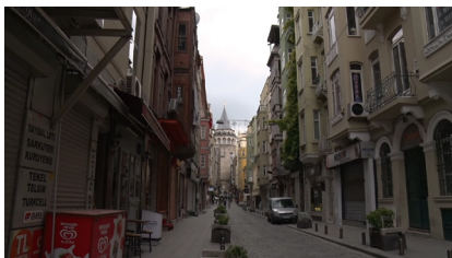
Wide angle (28.8 mm)

The high-performance Sony G Lens provided with the HXR-NX3 offers an expansive 28.8 mm (35mm full-frame format equivalent) angle of view at the wide end, with a 20x optical zoom range that will easily cover most shooting situations. When more reach is required, Clear Image Zoom employs Super Resolution Technology to provide excellent image quality at a 40x range.